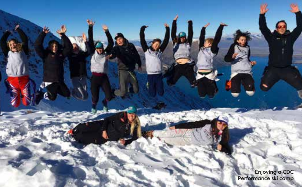
Enjoying a CDC Performance ski camp

we can help to grow and develop as people, not just racers.